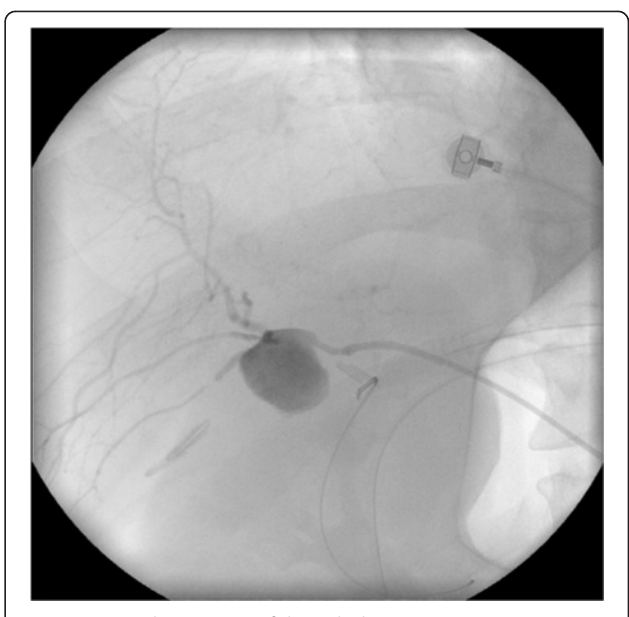
Figure 1 Pseudoaneurysm of the right hepatic artery on angiogram.

Two days following this discharge, the patient had an episode of haematochezia associated with collapse at home. He was taken to the emergency department of our hospital where he was hypotensive (blood pressure 92/63 mmHg) and tachycardic (heart rate 115 beats/ min). His abdomen was soft and non-tender, and digital rectal examination revealed dark red blood. His haemoglobin level was 111 g/L. He was initially resuscitated with crystalloids, but had further episodes of fresh rectal bleeding. Repeat haemoglobin was 58 g/L, and packed red blood cell transfusion was commenced. Urgent selective computed tomography angiography was performed revealing a 2 × 2 centimetre aneurysm arising from the RHA/cystic artery adjacent to surgical clips. The aneurysm was embolised with platinum and stainless steel radiological coils (Figure 1, Figure 2). A tubogram through the biliary stents after the procedure showed no evidence of leakage or stricture of the biliary anastomoses. He had no further bleeding and was discharged three days later. Four weeks later, the stents were removed in the outpatient rooms.