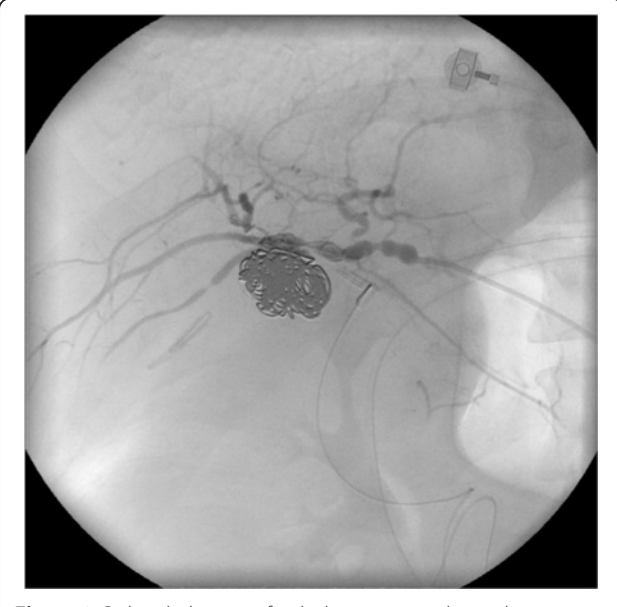
Figure 2 Coil embolisation of right hepatic arterial pseudoaneurysm.

A magnetic resonance cholangiopancreatography (MRCP) was performed, showing slight prominence of the intrahepatic biliary radicles above the level of the right and left main hepatic ducts, with preservation of