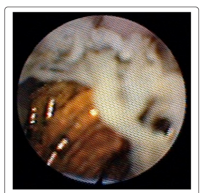
Figure 4 Coils seen around hepaticojejunostomy from within Roux limb on choledochoscopy.

Thus, approximately 10 months after his BD reconstruction, he was admitted electively for percutaneous transhepatic cholangiography (PTC) and balloon dilatation of this bilio-enteric anastomosis. After confirmation of the stricture by PTC, a 4 French catheter was inserted into his left ductal system and an 8.5 French pigtail catheter was placed into his right ductal system but neither could be advanced into the enteric limb (Figure 3). Two further attempts were made at PTC balloon dilatation, but both failed. It was decided to attempt to visualise the anastomosis through the Terblanche access limb. Choledochoscopy through the modified Terblanche access limb showed multiple radiological coils from the previous embolisation of the RHA pseudoaneurysm at the site of the anastomoses, causing a mechanical obstruction (Figure 4, Figure 5). Laparotomy was performed