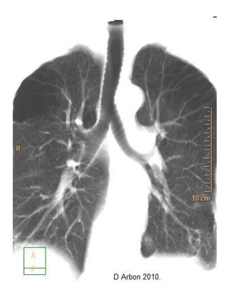
Figure 2: CT Scan of the human airways

Now we can see the nature of the lung, a collection of ever diminishing tubular segments and although a single breath might be dispersed throughout these passageways with practically no resistance. It is however, easy to see that individual branches when occluded by disease or mechanical invasion will starve the segments beyond of air.