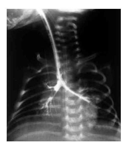
Figure 3: Neonatal Airway (Author)

A bronchoscopic voyage down the airways will also reveal this branching and narrowing of the human airways.<sup>27</sup>