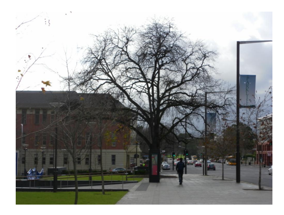
Figure 1: Branching in Nature

From an anatomical review of the lung we can see that the lungs far from being a, "bag in a box", as often depicted in those old textbooks, are a branching structure as is commonly found in nature (refer to figure 1). The sort of structure described by Mitchell Feigenbaum in his theory of order and chaos as is replicated in nature.<sup>25</sup> But also the structure you can easily make out when driving through the countryside in winter.