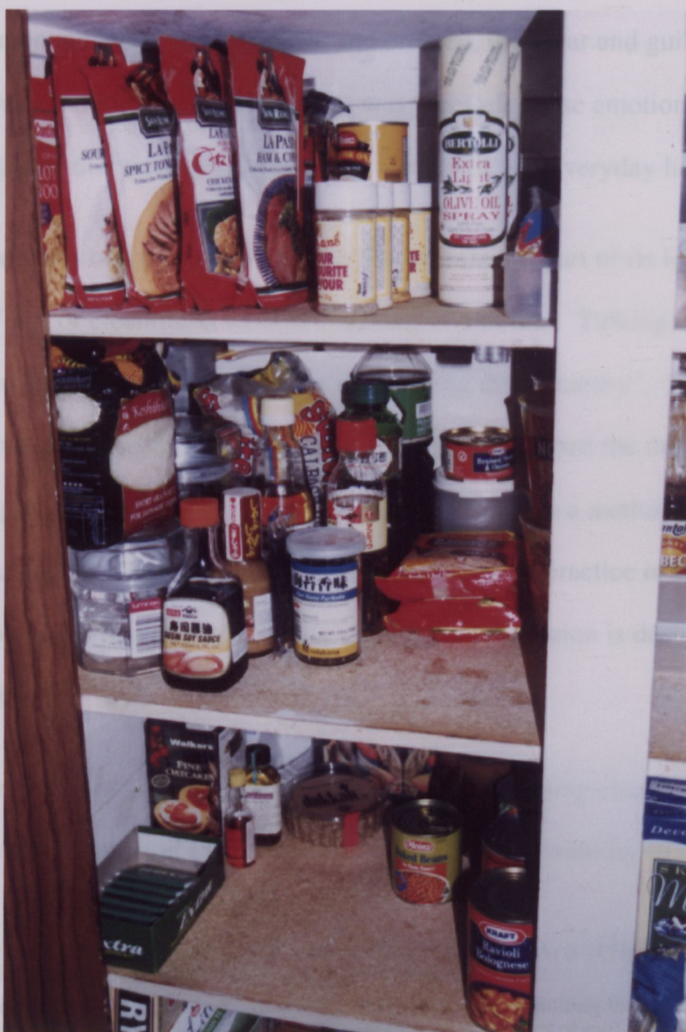
Plate 5. Natalia's kitchen cupboard

of the house" (Forty 1986: 169). 15 The design of household items (such as white baths and refrigerators) in the 1920s began to embody these virtues, "warning of the consequences of neglecting health and cleanliness which ranged from emotional rejection by loved ones to social ostracism, illness, death and national downfall" (ibid: 170). Removing dirt went hand in hand with the erasure of these associated emotions,