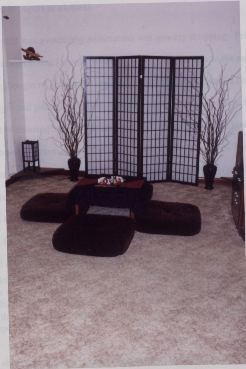
Plate 1. Natalia's 'dining' room