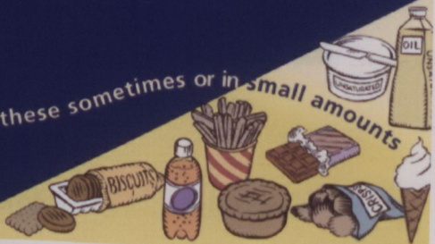
Plate 2. Food Circle

Choose these sometimes or in small amounts