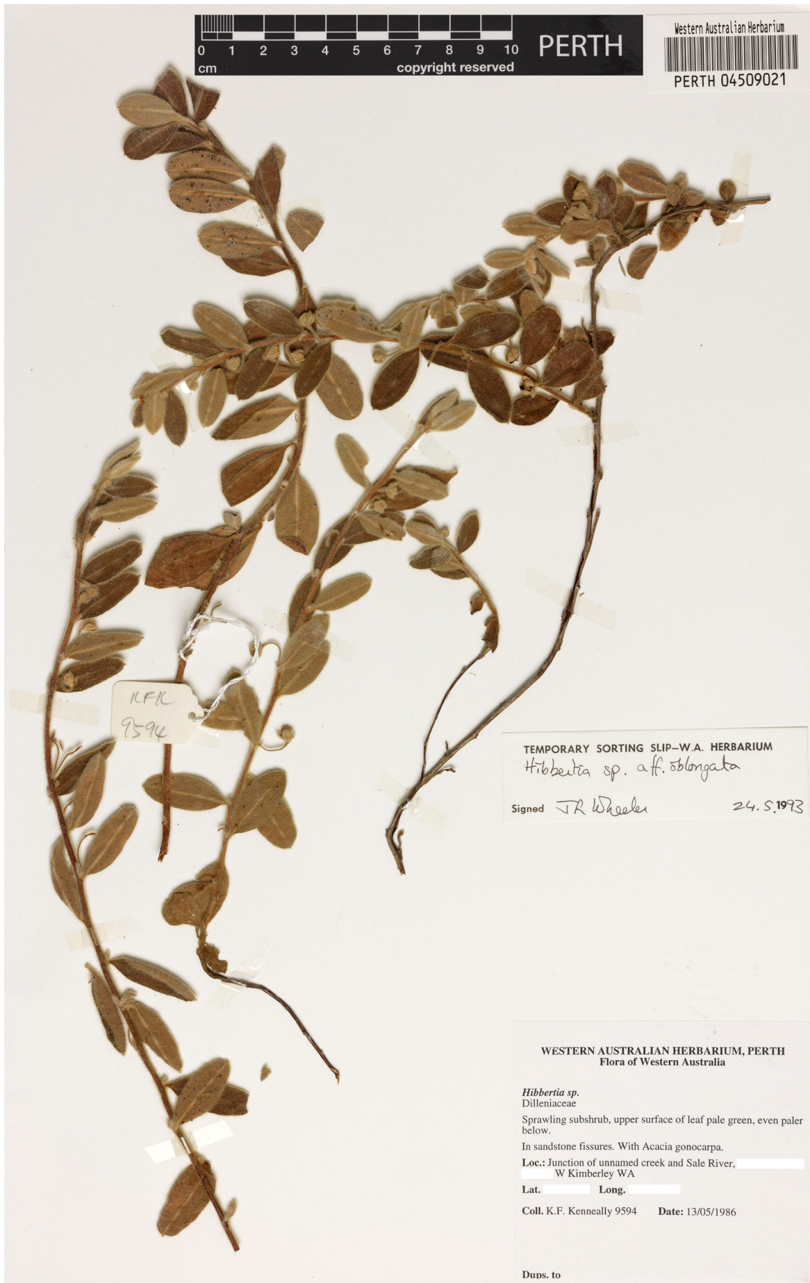
Fig. 1. Holotype of Hibbertia hesperia (PERTH 04509021; precise locality obscured for conservation reasons).