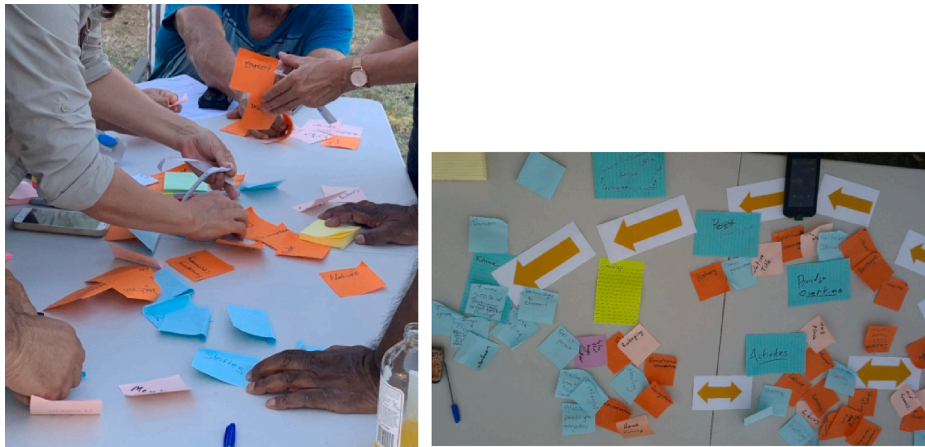
Fig. 1. During the storytelling sessions, important aspects and flows were also recorded on sticky notes by board members.

Hindle, 2007), board members spent much time discussing the importance of repairing/healing that damage ( 'Bridge over troubled waters' ) to build a better 'Future' . Notably, the ES and other keywords/activities embedded within the first three themes were seen as important contributors to that healing process.