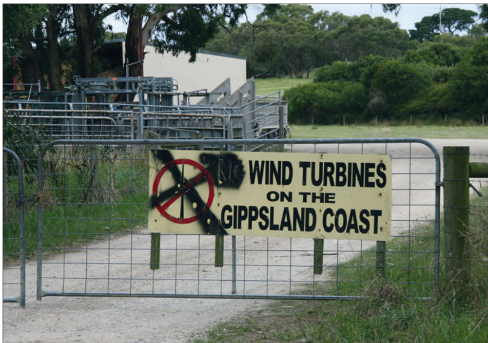
Figure 6.3: Principles of amenity and landscape value still mix with more utilitarian and instrumental uses of land (Photograph, Lee Godden, 2011)

rural amenity and lifestyle, while supporting living opportunities in rural areas throughout the Shire. 74