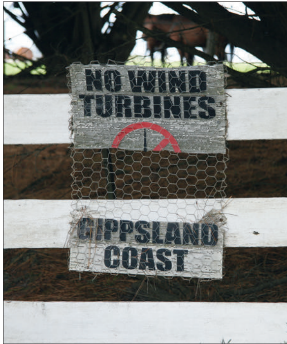
Figure 6.1: Farm gate protest, Gippsland Coast

orange-bellied parrot, are one such matter relevant to granting approvals for wind farms under the EPBC Act. 39 The company behind the Bald Hills proposal, Wind Power, said the federal decision was 'completely unreasonable'. 40 On the other hand, a spokesman for the Tarwin Valley Coastal Guardians lauded the federal decision, noting, 'There were over 1500 objections to the proposal'. Another local greeted the decision as a win for locals, commenting, 'If people want to put wind farms in