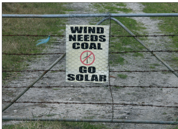
Figure 6.2: Competing values, farm gate protest

under recent planning law amendments again brings the map into play as the prerequisite for legal decision-making. The Bald Hills project escaped the spatial net of restrictions that now surround wind farm developments in Victoria. Yet as the wind power company website reflects, there remains an acute