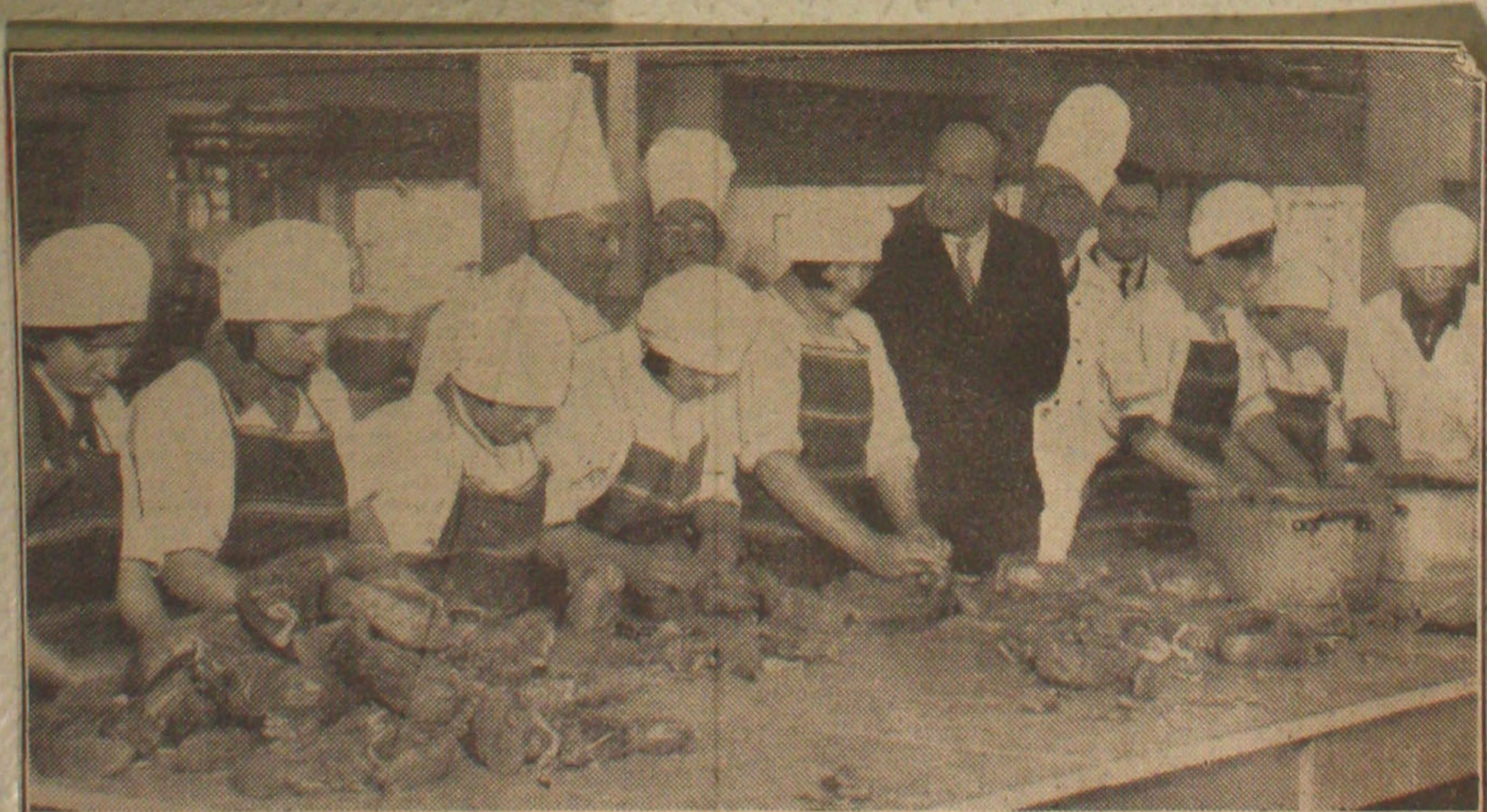
CHOOSING THE FOOD SUPPLY: Sir Douglas Mawson, who will leave for the Antarctic on August 1, watching girls prepare food for his expedition. The crew will probably comprise 28 officers and men, with a scientific staff of 12.