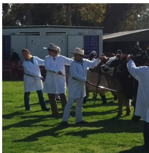
Final Handler line up