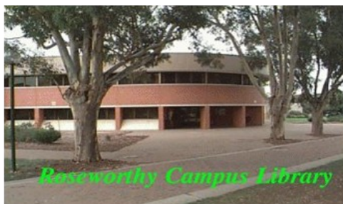
Roseworthy Campus Library